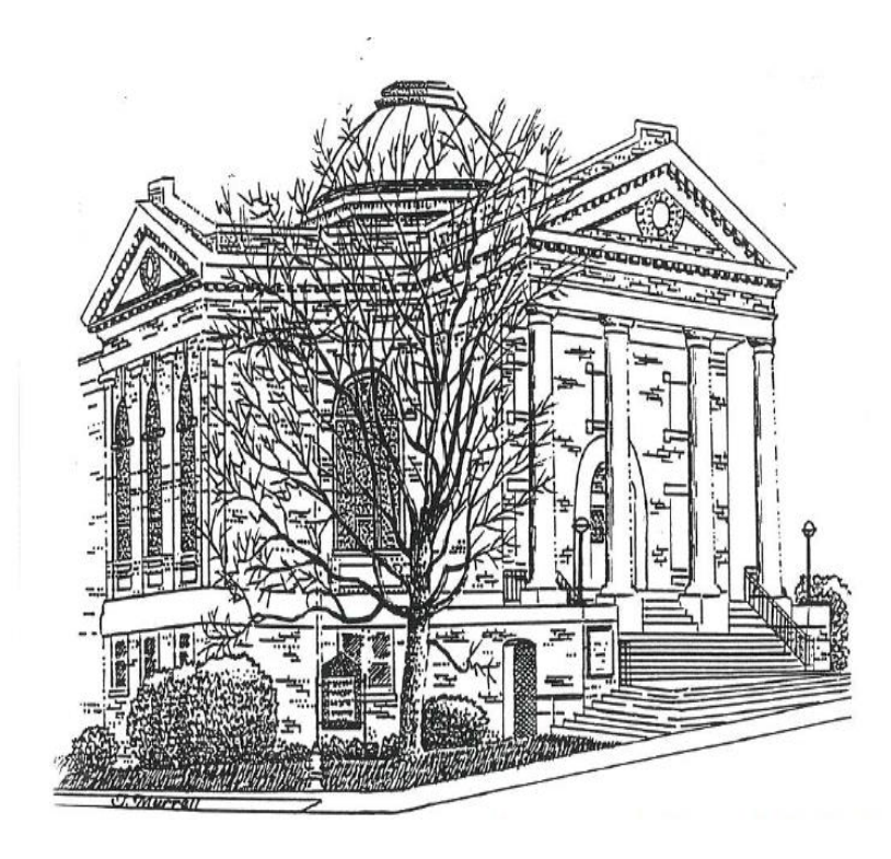
SERVICE FOR THE LORD'S DAY February 5, 2023 5<sup>th</sup> Sunday After Epiphany