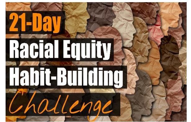
Education and Conversation Tuesday, January 26 at 7:00 p.m. via Zoom

Our congregation, along with many others, is continuing a challenging journey of educating ourselves about race in America. Members of the church have been gathering on Zoom to explore how we benefit from or are affected by systems of privilege, and how we might bring about a kingdom-oriented world in which, we are all one in Christ (Galatians 3:28).