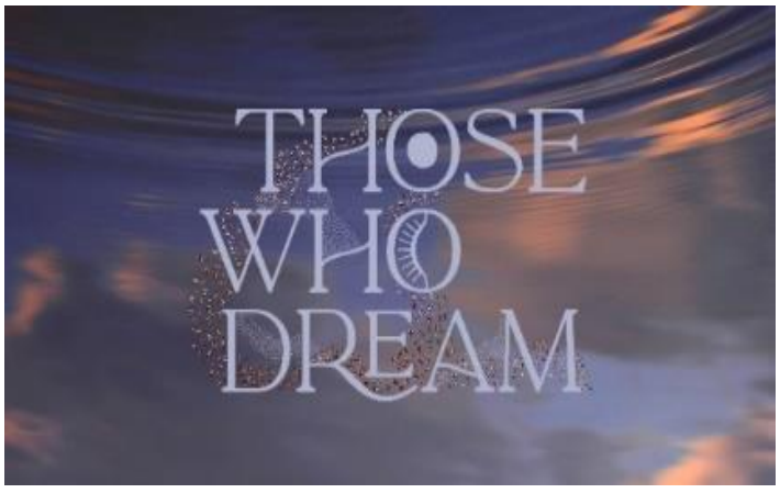
Advent Drive-Thru Sundays following Worship