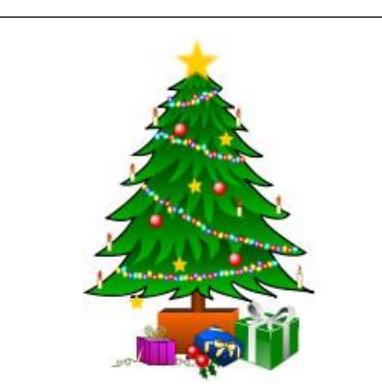
Angel Tree 2020

The Faith on the Fifth Offering will be received on Sunday, November 29 and will be donated to The Bridge to Recovery (BTR). BTR provides low cost and free assistance to women and men seeking treatment for addiction problems whether it be alcohol, drugs, or a combination of both. Funded by donations from churches, individuals, and foundations, the theme of BTR is to remove barriers and form a bridge to recovery for individuals who desperately want help. Please donate generously to this Faith on the Fifth Offering.