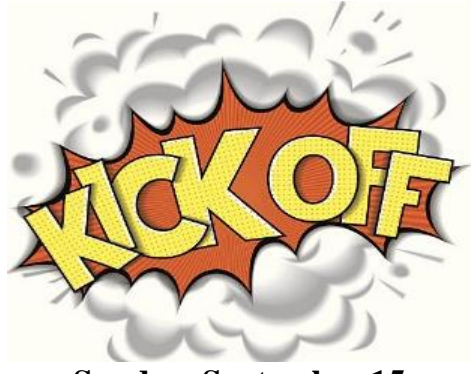
Sunday, September 15 6:00 p.m.-8:00 p.m.