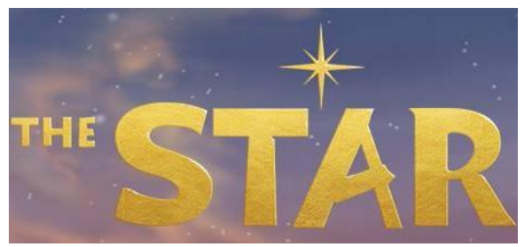
Christmas in August Movie Night on Friday, August 24 6:00 p.m. in the church theatre