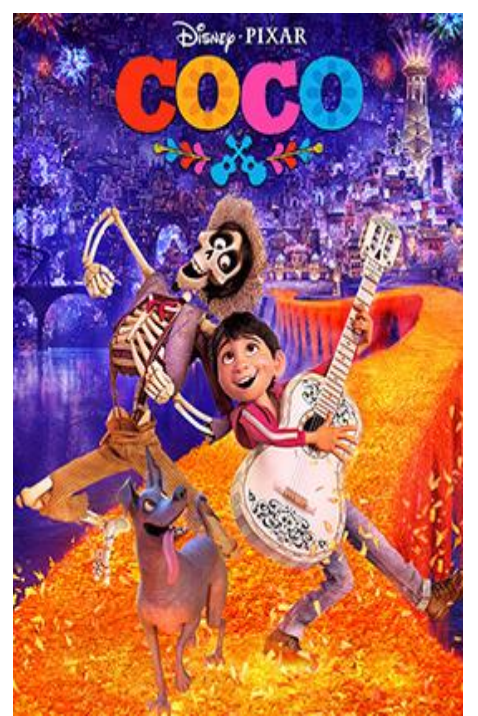
Movie Night Friday, April 13 at 6:30 p.m. in the Church Gym *Bring the entire family out to enjoy a movie with friends, popcorn, candy & drinks...

*Bring a chair or blanket and plan to relax and laugh out loud!!!